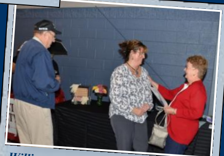
Williams County Department of Aging