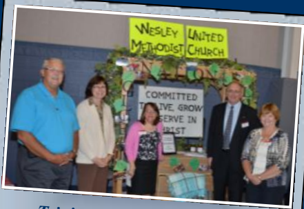
Trinity Lutheran Church and Wesley United Methodist Church