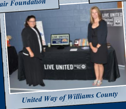
United Way of Williams County