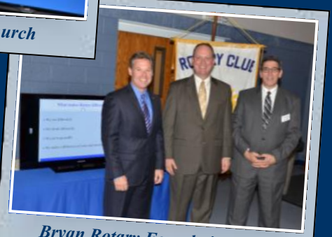
Bryan Rotary Foundation, Inc.