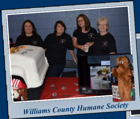
Williams County Humane Society

The other participating organizations received $250. All awards were credited to their endowment funds.