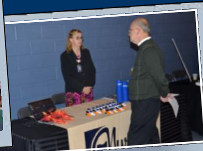
Northwest Ohio Educational Service Center