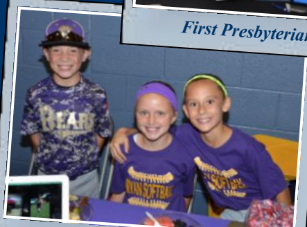
David Betts Double Play Diamond