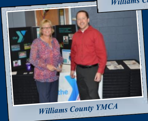
Williams County YMCA