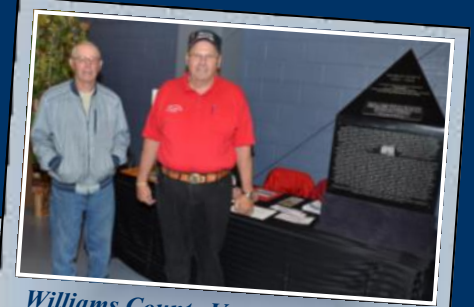
Williams County Veteran's Memorial Building