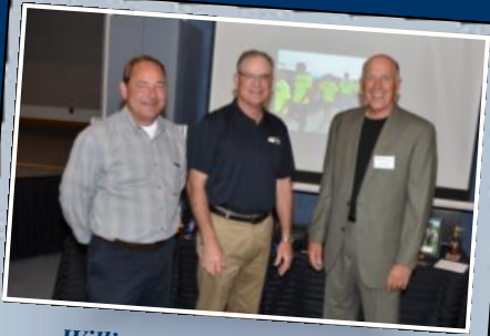
Williams County Sportsman's Educational Association