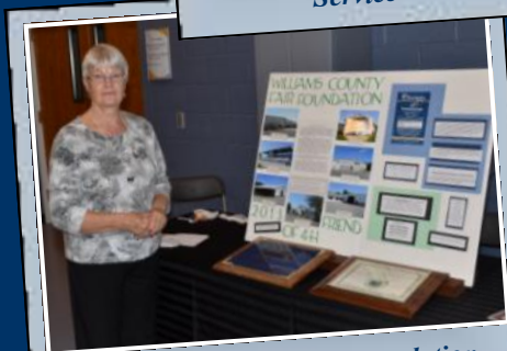
Williams County Fair Foundation