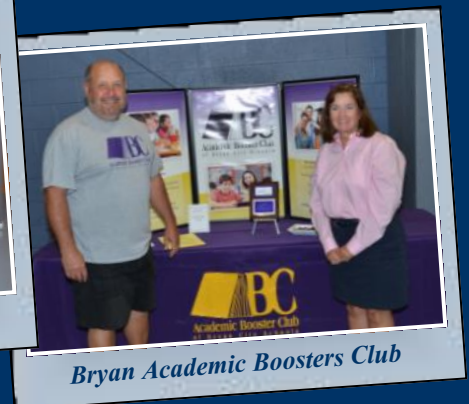
Bryan Academic Boosters Club