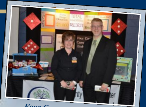
Four County Career Center