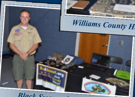
Black Swamp Area Council Boy Scouts of America