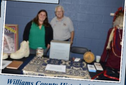
Williams County Historical Society