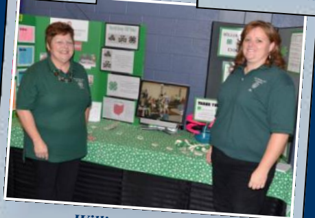
Williams County 4H