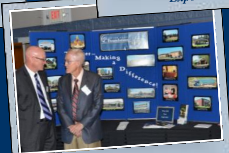
Bryan Area Foundation