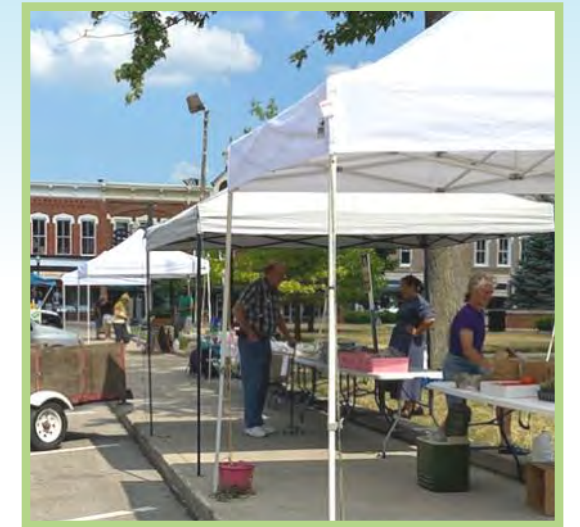
Bryan Development Foundation