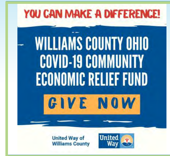
United Way of Williams County

Amphitheater with Interactive Fountains - $260,000