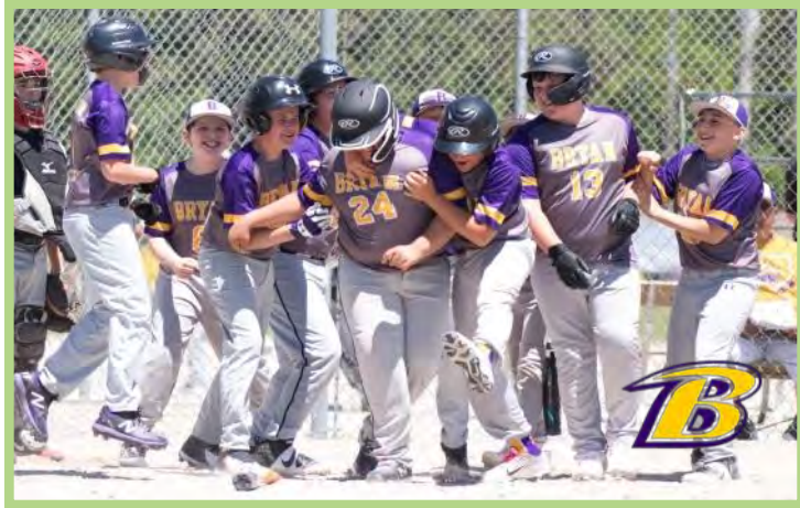
Bryan Baseball Association