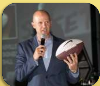
Danny Wuerffel, 1996 Heisman Trophy winner and Executive Director of Desire Street Ministries