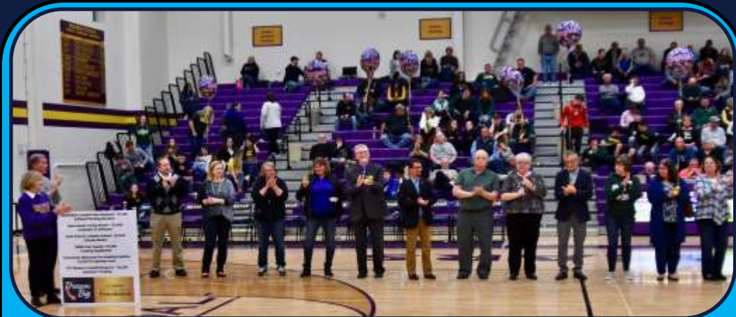
Twelve organizations were recognized for receiving a Dream Launcher Grant during halftime of the BHS boys basketball game, Friday, February 22, 2019

To celebrate the Foundation's 50th Anniversary, $50,000 has been allocated for the special Dream Launcher Grant Program. Nonprofit organizations operating programs that benefit Williams County residents are eligible. Dream Launcher Grants range between $1,000 and $2,500.