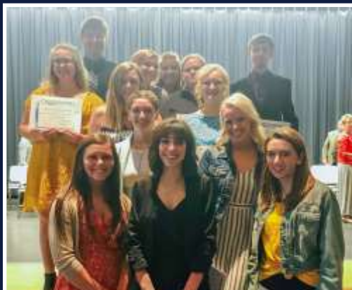
Edon High School

Millcreek-West Unity Area Foundation AWARDED $9,500