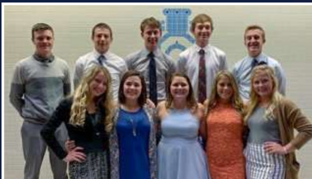
Montpelier High School