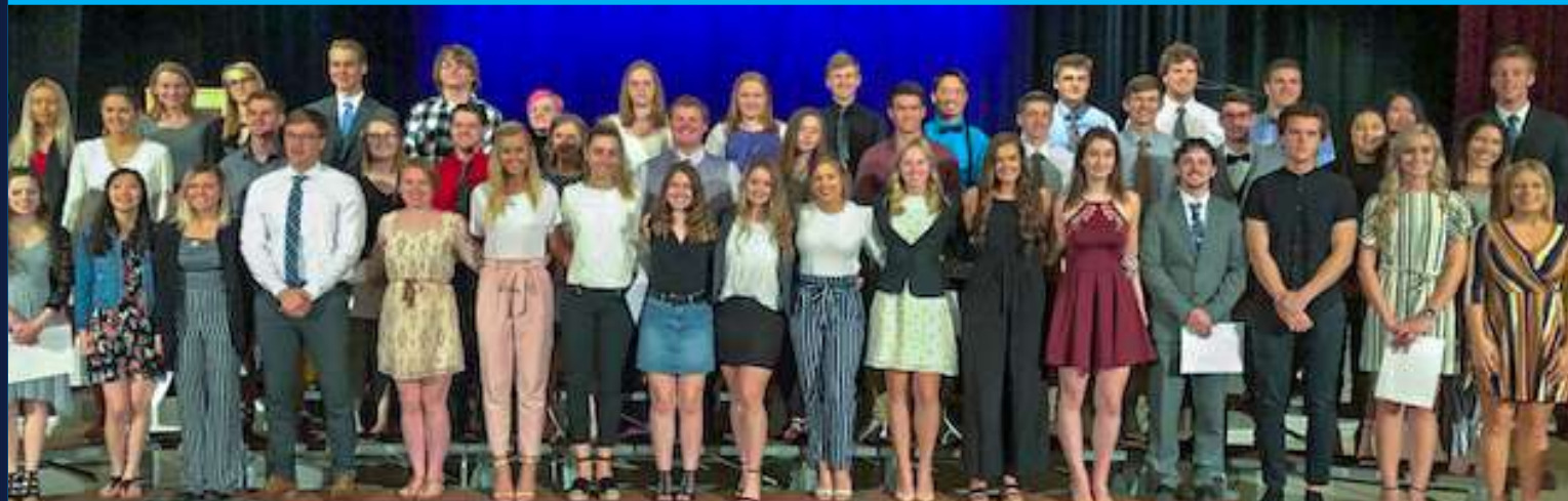
Bryan High School