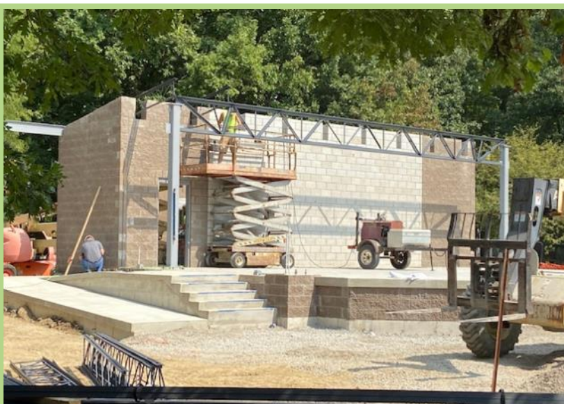
Fountain City Amphitheater

I am very much looking forward to serving the community over the next two years. I am hopeful we can reenergize the pride in our community and continue to make a difference for those who reside in the Bryan area.