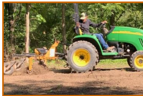
Grading for the course