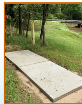
Hole # sign post and tee shown with cement pad