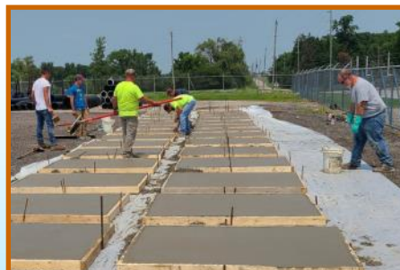
Cement pads are poured and set