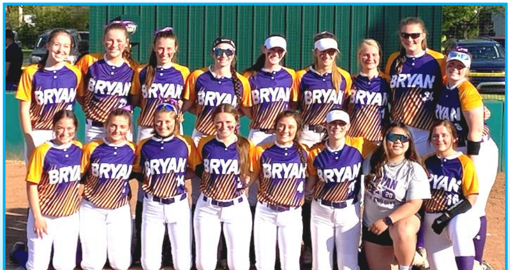
2021 Bryan High School Girls Softball Team