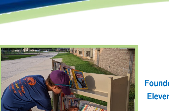
St. Patrick Catholic School Summer Reading Program - $2,100