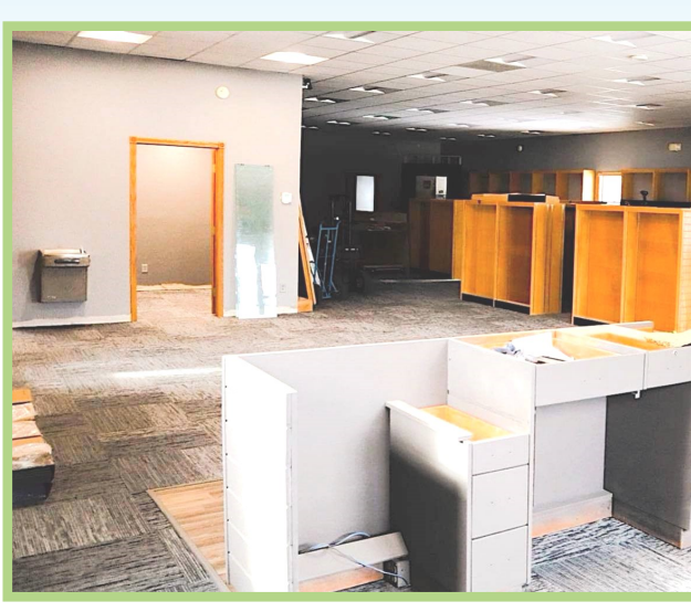
Stryker Friends of the Library - Renova

Thank you to our donors who significantly impact our communication to address the most urge grant making process. Donors may establish a new fund or give to do