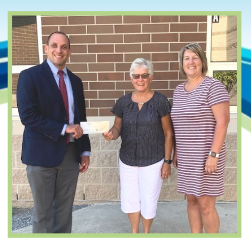
Edon Northwest Local Schools Covid-19 Expenses - $1,939

The Edon Area Foundation approved a grant to the Edon Northwest Local Schools for the express purpose of assistance with COVID-19 expenses, including masks, sanitizers, face shields, or water bottles.