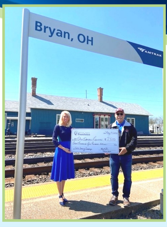
Ohio Operation Lifesaver Geo Fencing PSA Campaign - $2,500