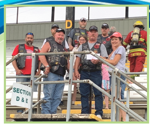
The Montpelier Area Foundation awarded $2,000 to Nozzlemen Ohio Chapter 1 for a 9/11 Stair Climb to be held at the Williams County Fair.