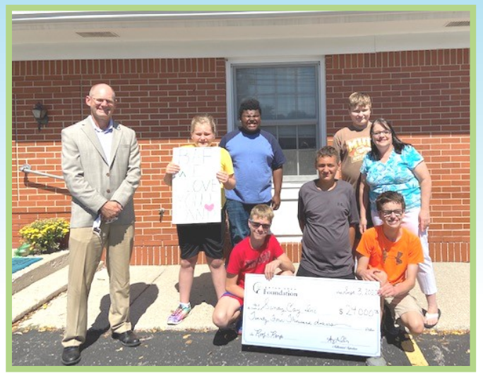
Sandy Cay, Inc. Roof Replacement & Ramp - $24,000

American Legion - American Flags for the Square - $1,080 Bed Brigade of Williams County - Bed Distribution - $2,000 Williams Co. Humane Society - Community Cat Program - $1,602