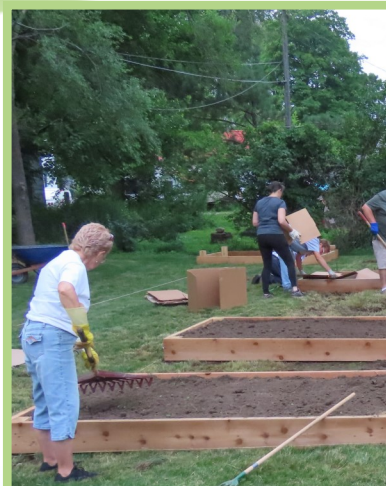
Williams Co. Community Garden Association Garden Fencing - $1,700

Founders Grants are for nonprofits seeking funds for smaller, yet sti A simplified application was created and follows the same deadlines and e