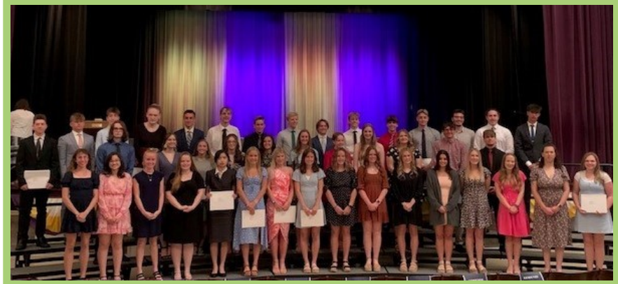
2022 Bryan High School Bryan Area Foundation Scholarship winners