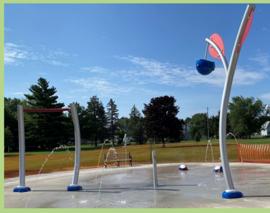
Village of West Unity Splash Pad Installation $20,000