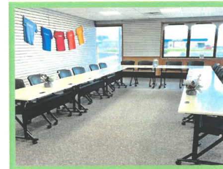
United Way of Williams Co. Community Meeting Room - $6,240