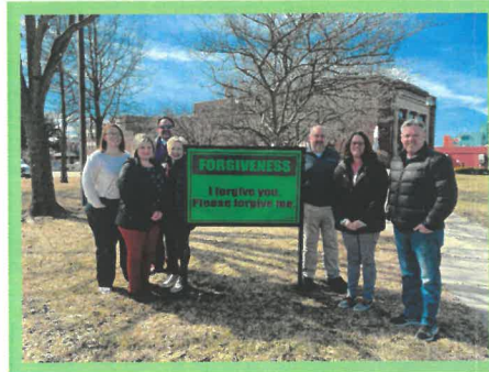
Community Advocates for Healthy Families Character Trait Signs - $15,500