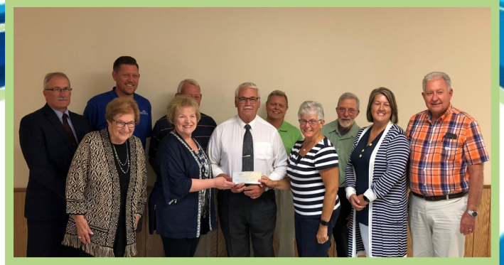
Edon Village Parks Walz Park - $21,571

The Edon Area Foundation awarded a grant to the Village of Edon to update the playground equipment at Walz Park.