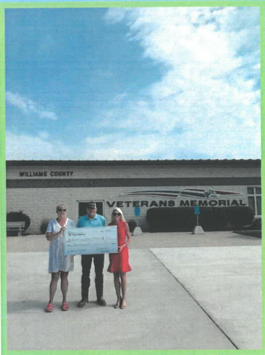
Williams Co. Veterans Memorial Building, Inc. Concrete Parking Lot - $90,000

Thank you to our donors who significantly impact our community by establishing Community Funds. Community Funds allow the Foundation to address the most urgent needs of the community through our grant making process. Donors may establish a new fund or give to one of our 171 existing Community Funds.