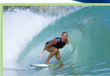
Inspirational Speaker, Bethany Hamilton