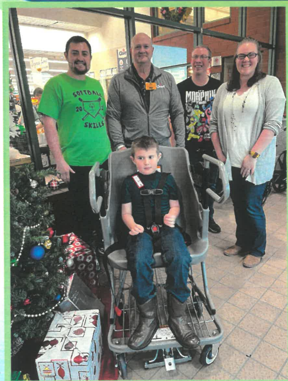
Williams Co. Board of DD Caroline's Carts - $2,533

Community Funds made these grants possible!