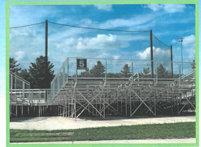
Bryan Girls Softball Association Field 5 Improvement Project - $110,000

Bryan City Schools - P.J. Fleck Speaker Event - $3,500 City of Bryan / Parks & Rec - Amphitheater Lighting & Sign Project - $50,000 Sarah's Friends - Transitional Housing Unit 114 Renovation - $17,850 Village of Edon - Walz Park Playground - $50,000