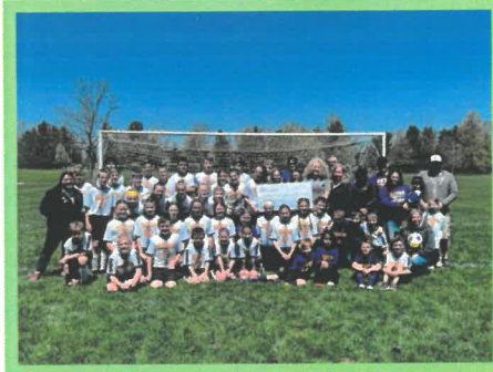
Bryan Soccer Association Goals & Field Improvements - $30,000