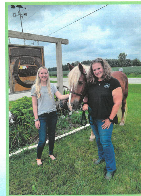
Sarah's Friends Therapeutic Riding for Survivors of Crime - $2,500