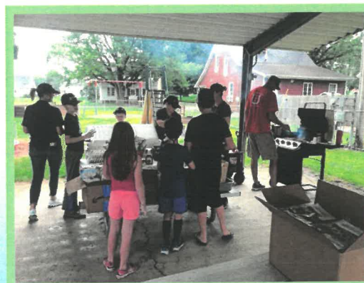
Edon Area Ministerial Edon Summer Lunch Program - $500