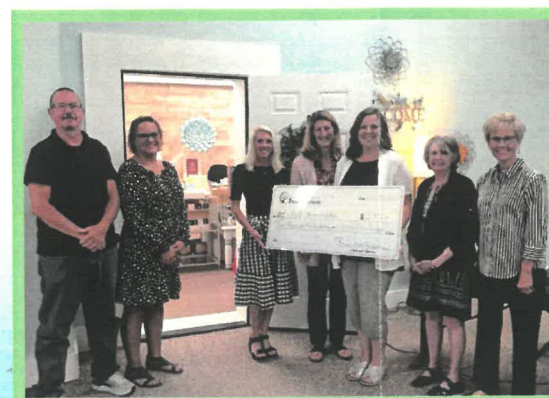
Joyful Bird Ministries Doorway between Buildings - $2,500