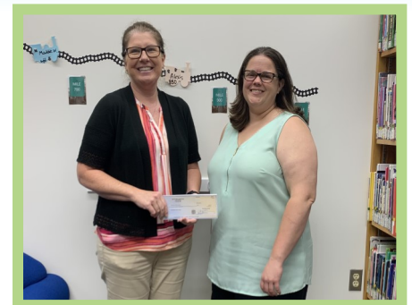
Montpelier Public Library Library Kit for Newborns - $2,000

Friends of the Montpelier Parks, Inc. - Bean Days Inflatables - $3,000 Friends of the Montpelier Parks, Inc. - Summer Youth Tie-Dye Program - $1,333 Hands Helping Hands Ministry, Inc. - Back Pack Program - $1,333 Montpelier Public Library - Wonder Books - $1,334 Montpelier Exempted Schools - Athletic Department - $517 Williams Co. Veteran's Memorial, Inc. - Parking Lot - $10,000 Williams Co. Sheriff's Dept. - Forensic Training, Equipment, & Supplies - $2,000 Williams Co. Sheriff's Dept. - Mounted Division Equipment & Training - $760