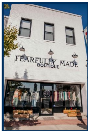
Fearfully Made Boutique