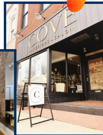
Cove: Interiors + Salon

While focusing on improving the physical building stock on Bryan's historic downtown square, the Bryan Area Foundation also invested in building Bryan's digital presence collaborating with consultants from Small Nation to develop a downtown Bryan branding campaign, website, and social media channels. In December 2022, www.visitbryanohio.com launched with the tagline, "Live the Sweet Life." These digital assets, along with the investment in physical buildings, are just a few examples of the Bryan Area Foundation's commitment to "Building for the future."