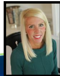
President / CEO

Thursday, 4/18/2024 5:00 PM Registration/Networking 5:30-8:30 PM Training