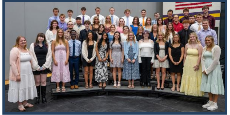
2026 Scholarship recipients from the Bryan High School class of 2026

The Bryan Area Foundation awarded 80 scholarships to 46 soon-to-be Bryan High School graduates, totaling $210,250. Congratulations to each of them and the other scholarship recipients, and thanks to the many donors and presenters who are helping these students achieve their educational goals!